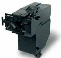
HP Embedded Spectrophotometer