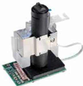
HP Optical Media Advance Sensor (OMAS)

HP Instant Printing PRO allows you to quickly preview, crop, and print in large format using one simple tool, providing a quick and easy way for reprographic and copy shops to print in large format. You can easily manage your files from one single application. Just drag and drop PDF, 7 TIFF, JPEG, PPT, 8 HP-GL/2, and DWF files to HP Instant Printing PRO to manage and preview them. Access the job queue as well as accounting information with one simple click. HP Instant Printing PRO enables true print confidence. Avoid printing on the wrong-sized media with a realistic print preview.